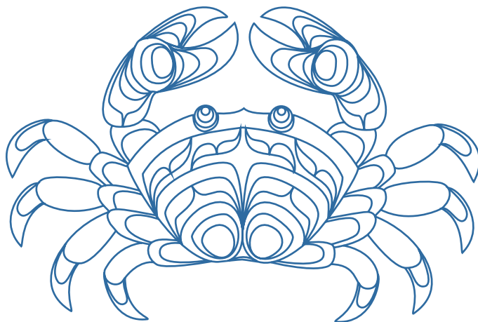
k u'mis (crab)